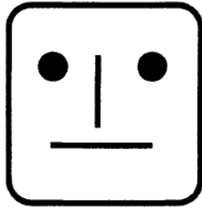
what industry wants

Industry requires engineers who have a complete knowledge in all disciplines. By contrast, traditional academic courses tend to educate people into knowing everything about very narrow subject areas. There is also a very real danger that engineers will not develop the required breadth. Thus, in the final illustration the engineer is shown as someone having a broad knowledge, equipped with “ears” for noticing the detailed knowledge.