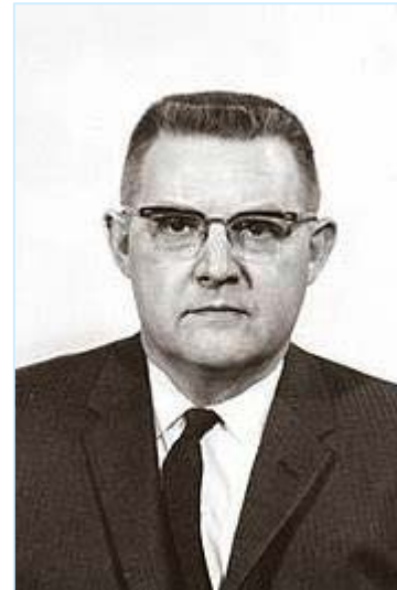
J. E. Shigley 1909-1994

When I started working at an engineering company, I fully understood that performance of an engineer depends on myriad factors. At the same time, I saw these two images in one of Joseph Edward Shigley's books titled: Standard Handbook of Machine Design.